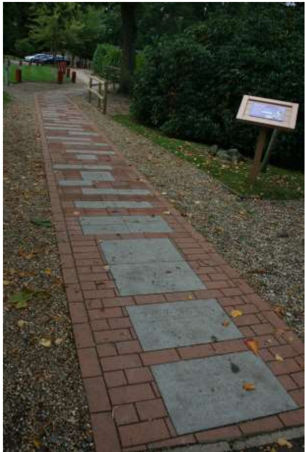
The Promise Path at Gilwell

The Scout Centre Oaken Lane Claygate Surrey KT10 0RQ