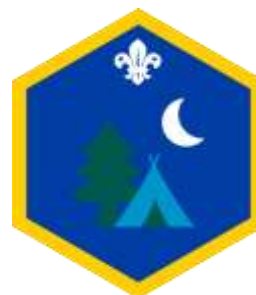
Outdoor Challenge Badge